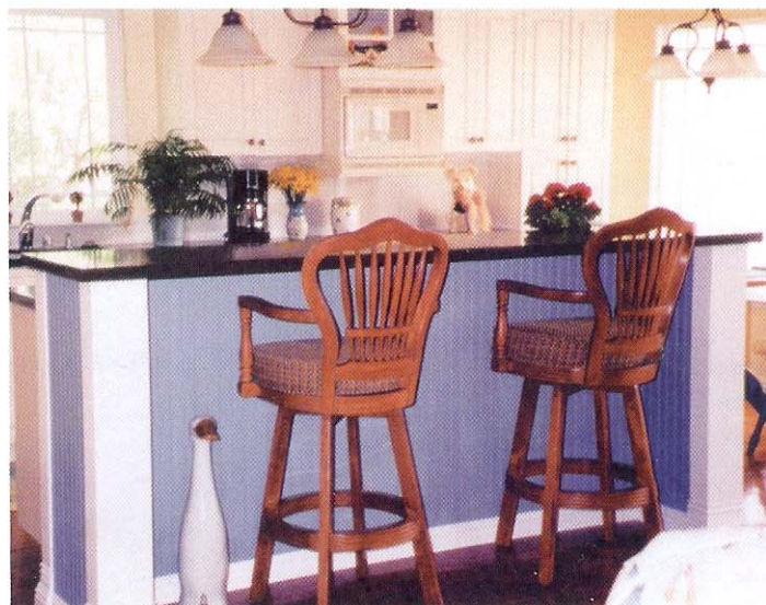
Blue and white country kitchen boasts multi-level island with raised area for dining. Big comfortable seats echo the country look. By Susie Rummel, Creative Solutions, Inc.