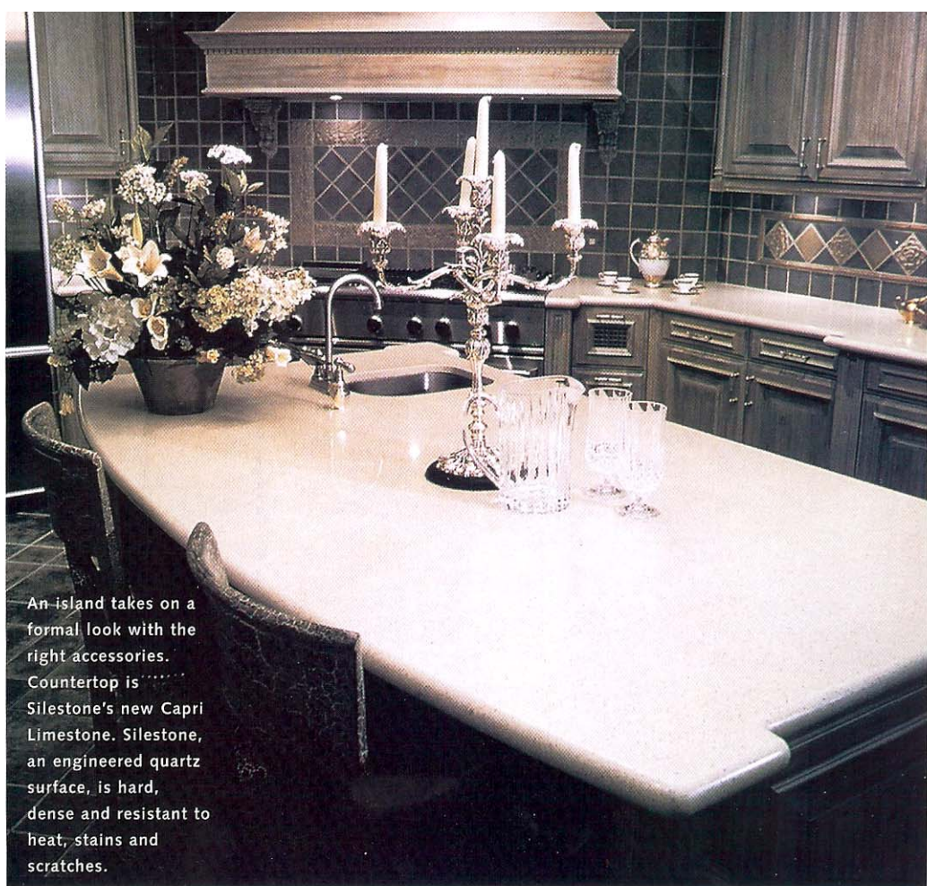
An island takes on a formal look with the right accessories. Countertop is Silestone's new Capri Limestone. Silestone, an engineered quartz surface, is hard, dense and resistant to heat, stains and scratches.

Do islands work for every style? We know they have huge design impact in sleek contemporary kitchens, take on the look of a kitchen table in country-style rooms and translate nicely into traditional ambiance. Is an island always the right